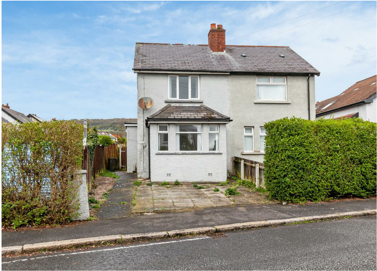
22 Wallasey Park, Belfast, BT14 6PN